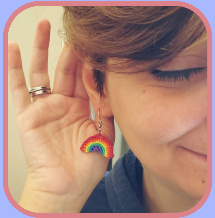
Rainbow Earrings @AshleyscrochetCA