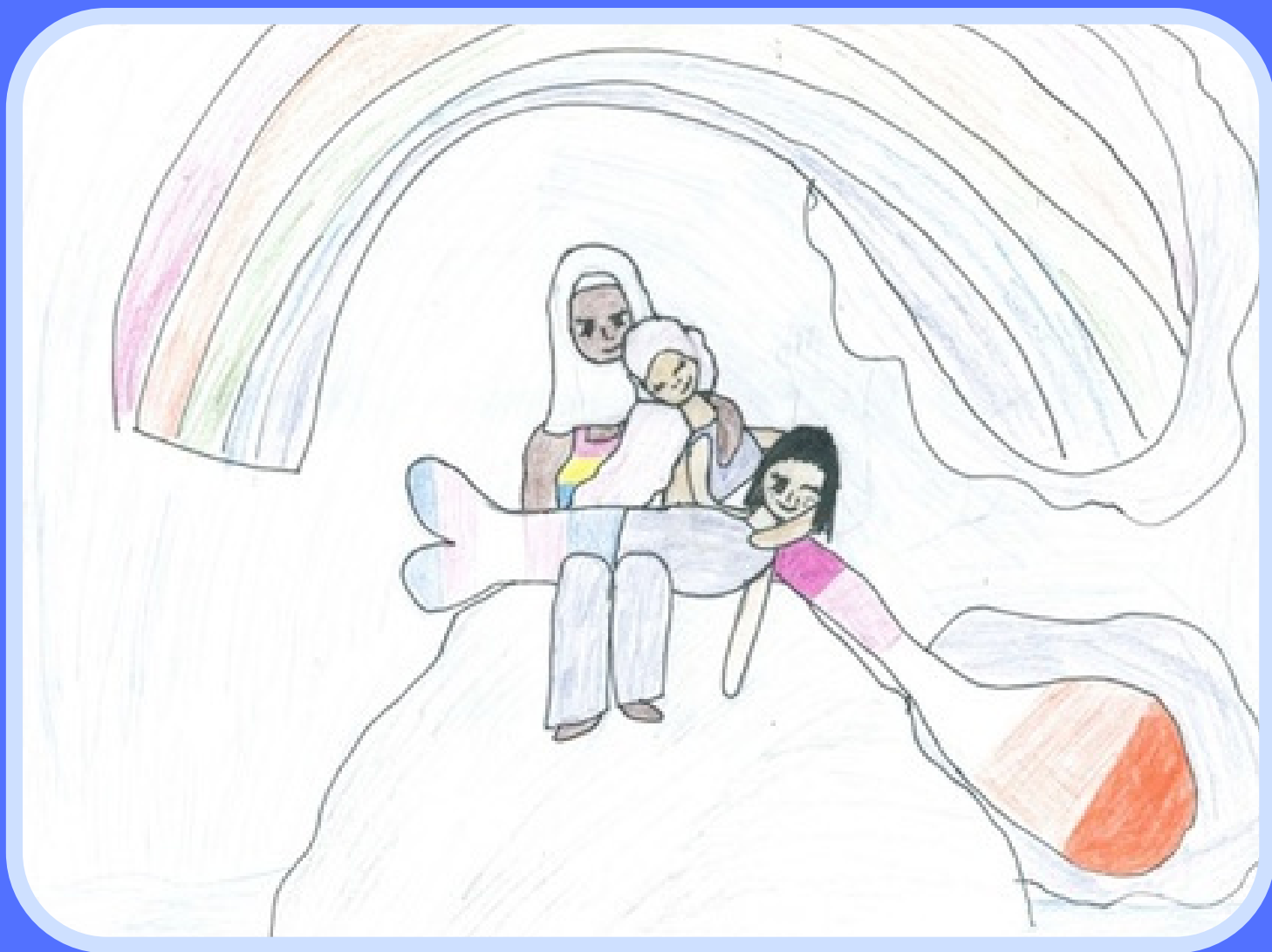
Image Description: A Pride-themed drawing of a selkie, a mermaid and a human-axolotl sitting together under a rainbow arched across the sky. Their tails and clothing are the colours of various pride flames including the lesbian pride flag, and transgender pride flag, and rainbow pride flag.

We can feel the magic through this drawing created by Tessa B., age 13. Thank you so much for submitting, Tessa!