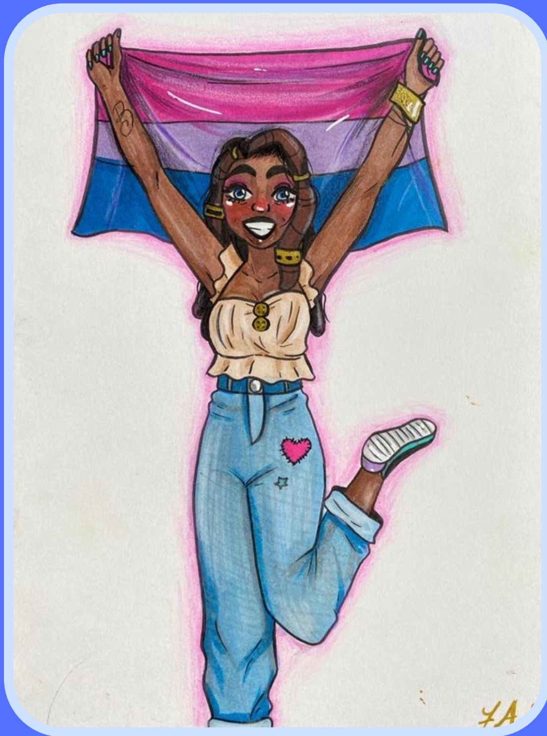
Image Description: A young, Black girl jumps for joy as she waves her Bi pride flag in the air. She is wearing a crop top and jeans embroidered with a star and a heart