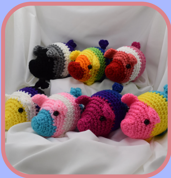
Pride Piglets @DoctorJCrochet